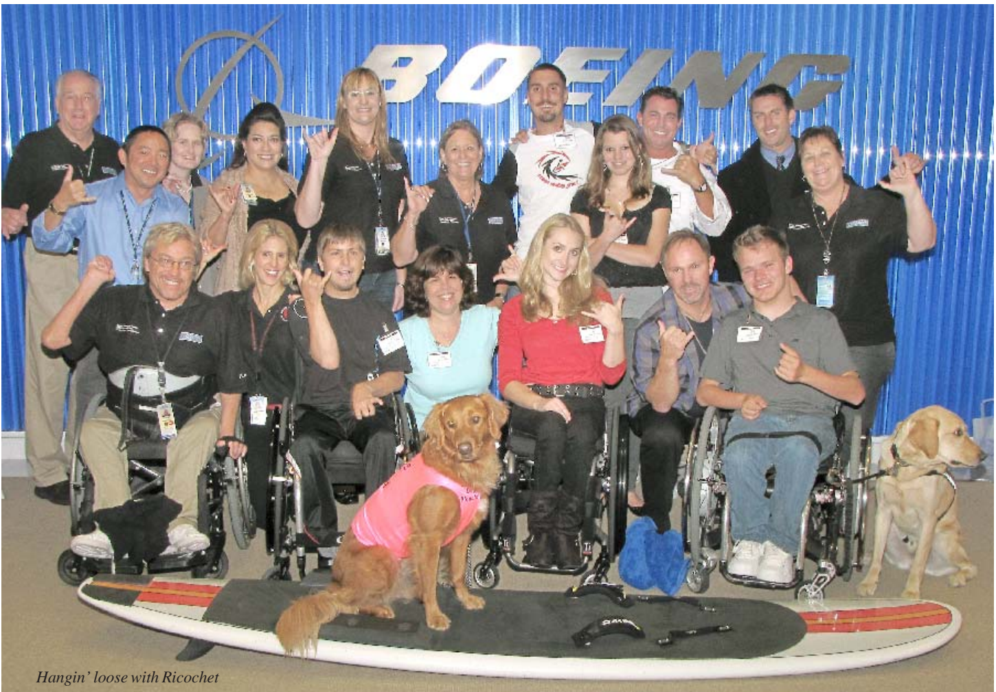
Hangin' loose with Ricochet

Ricochet video: http://www.youtube.com/watch?v=BGODurRfVv4 OHG: www.oceanhealinggroup.org OHG video: http://www.youtube.com/watch?v=zb8-KsO7Sxs W2W: www.wheels2water.org W2W video: http://www.youtube.com/watch?v=amGIwYGHK4M